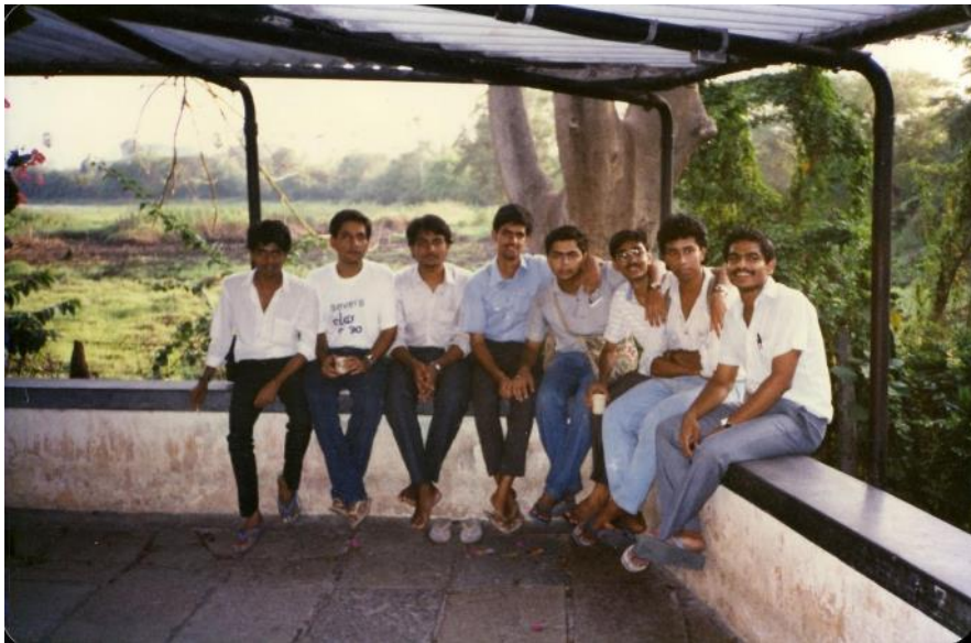
H7ites and a cack session in progress at H7's popular 'Marine Drive'