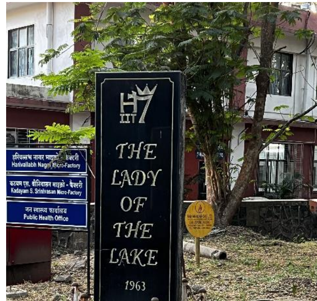
H7 has always been known as ' The Lady of the Lake ', every H7ite will recognize these images