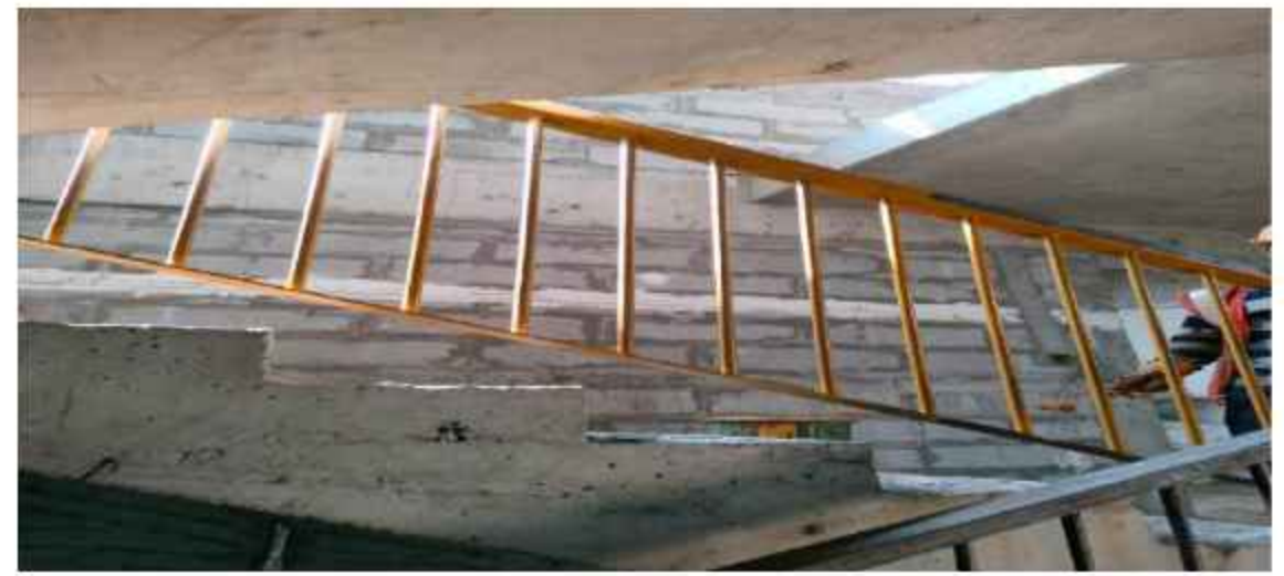
Hostel H-21 – 2th Floor Door Installation WIP