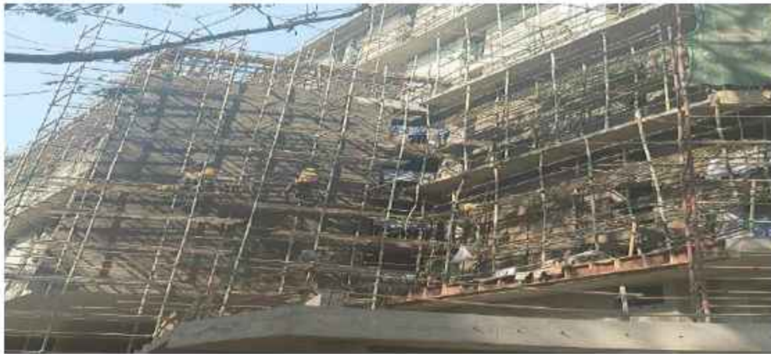
Hostel H-08 - External Plaster WIP