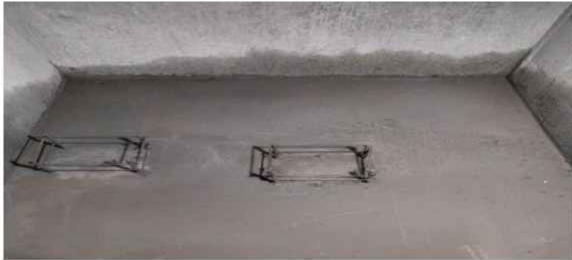
Hostel H-21-Lift Plum Concrete WIP