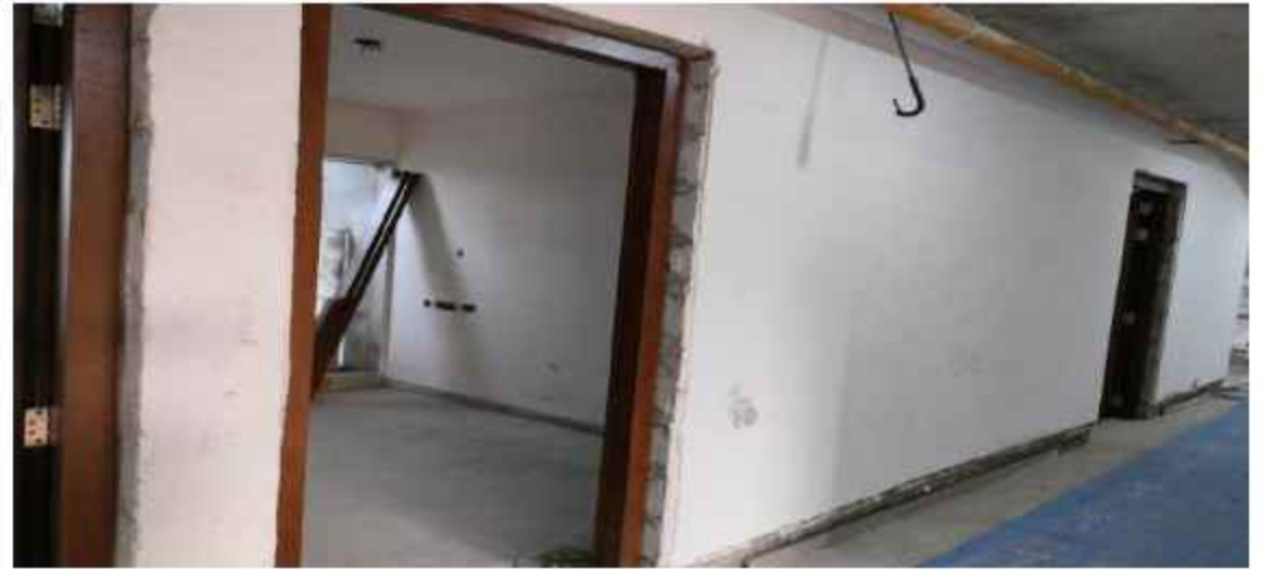
Hostel H-21 - Sixth Floor Door Fixing WIP