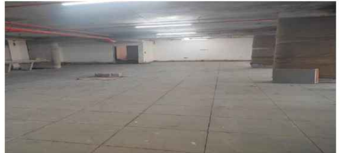
Hostel H-08 - Lounge Tiling WIP.