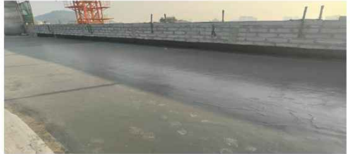
Hostel H-07 - Terrace Water proofing WIP