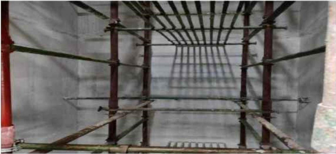
Hostel H-21- Lift Shaft Wash- WIP