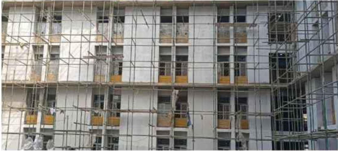
Hostel H-07 - External Progress WIP