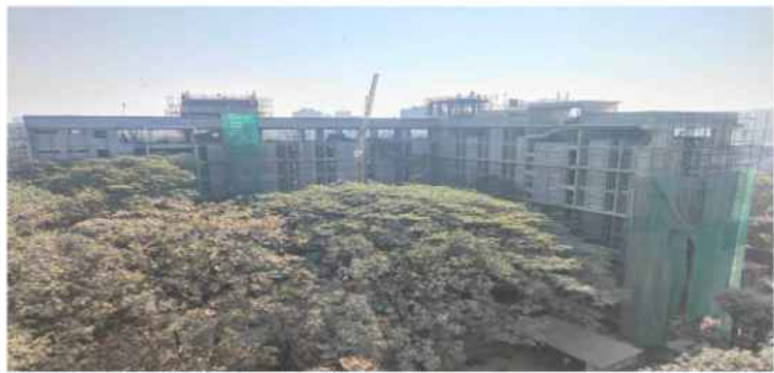
Hostel H-21- Elevation View