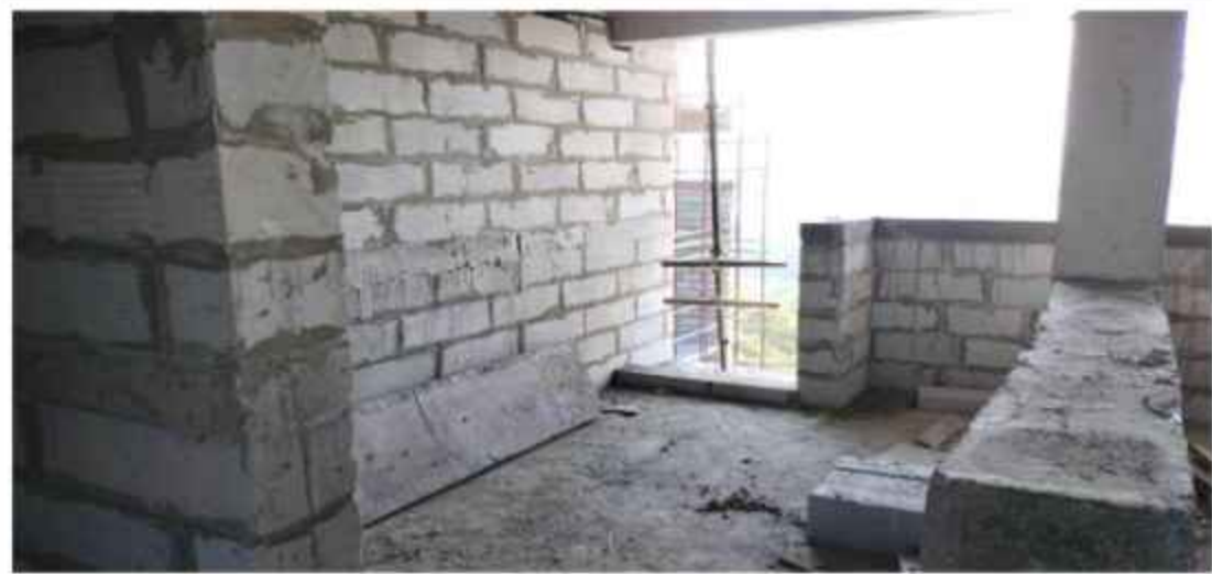
Hostel H-021 – 9 th Floor Masonry WIP