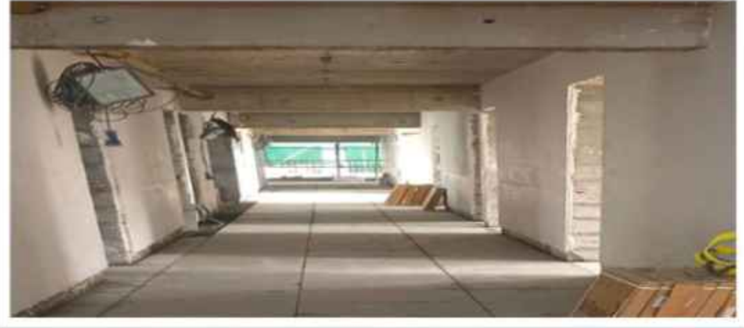
Hostel H-07 – Common Passage Tile WIP