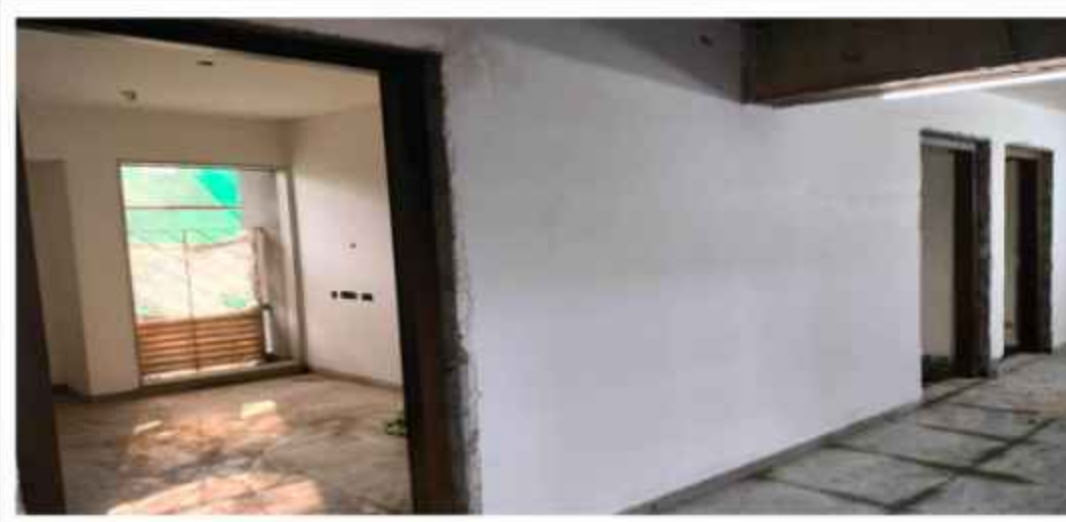
Hostel H-21 – 2 th Floor Door Installation WIP