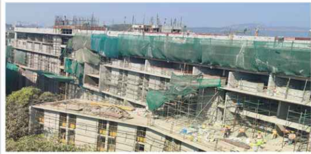
Hostel H -08 – Elevation View