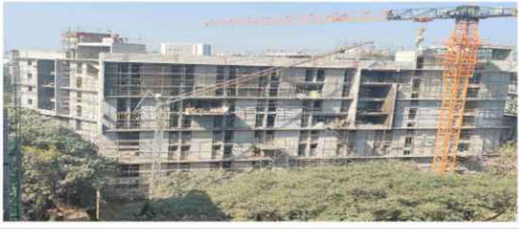
Hostel H-07 – Elevation View