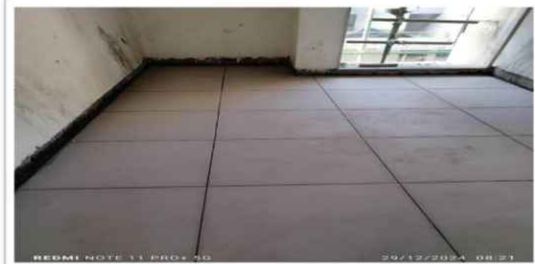
Hostel H-08 –7 th Floor Tiling WIP