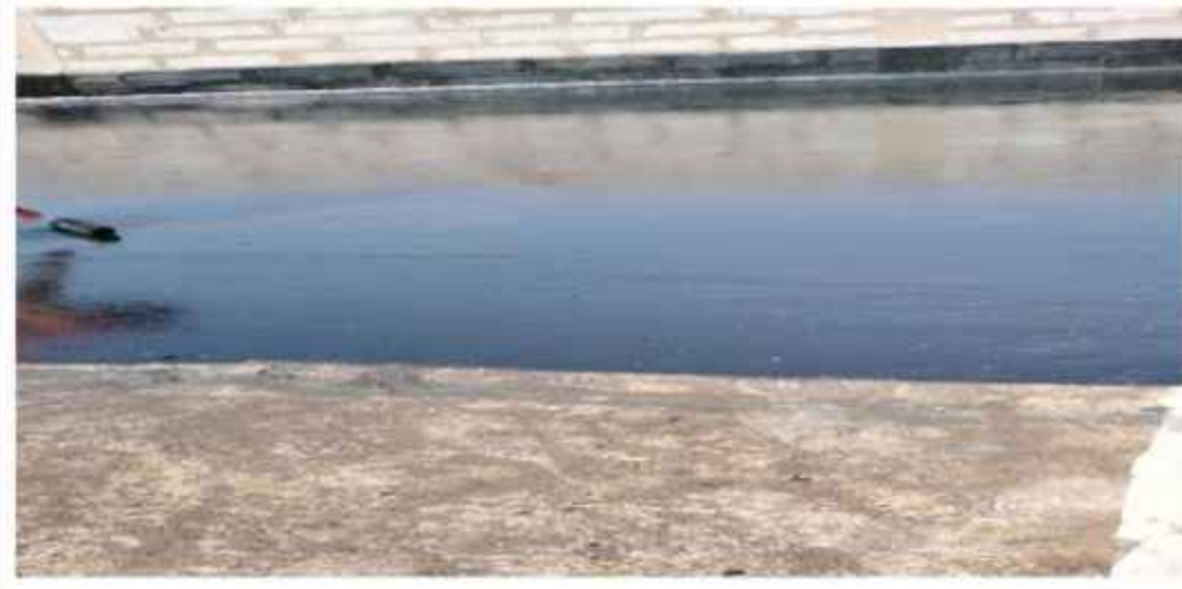
Hostel H-21-Terrace Water Proofing WIP