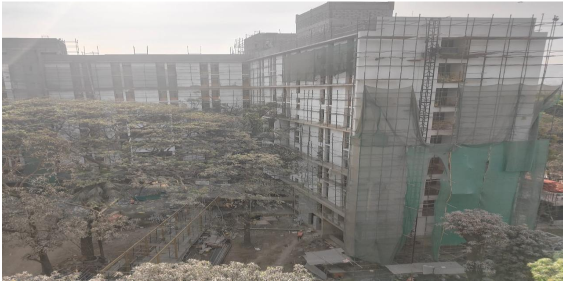
H-21- ELEVATION VIEW