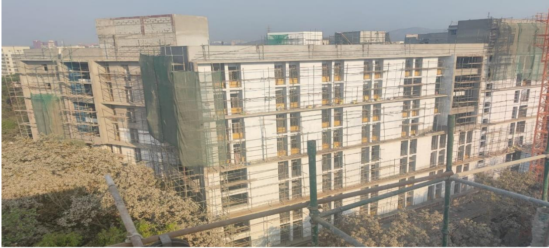
H-07 - EXTERNAL PRIMER WIP