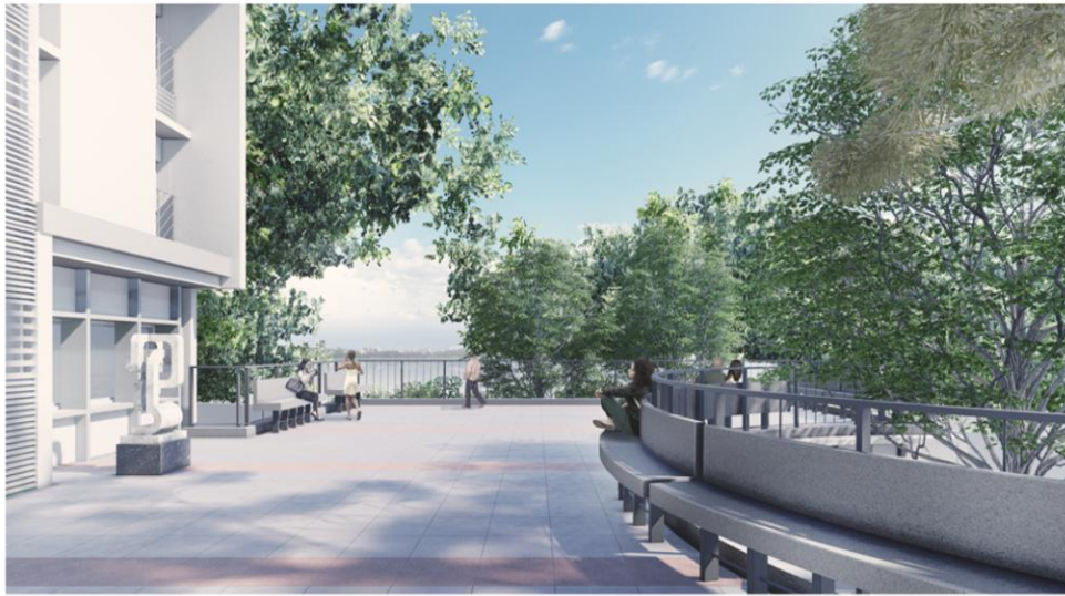
'Reverie', Mezzanine floor, H21.