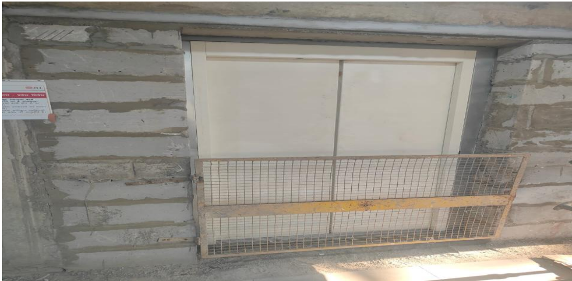
H-21 - LIFT DOOR INSTALLATION WIP