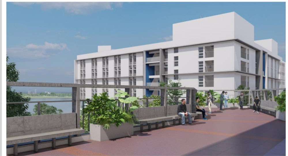
'Lake View Chill Zone', 6 th floor, H8