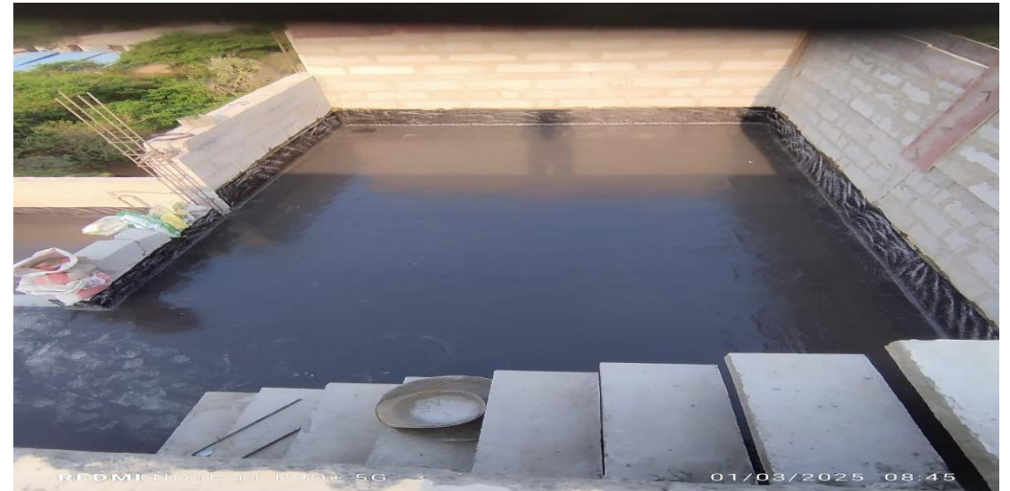
H-08 - STAIR CASE1 MUMTY SLAB WATER PROOFING WIP