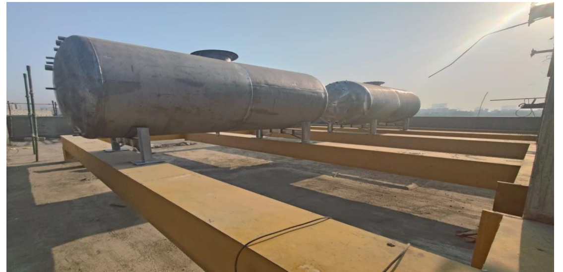
H-21 - HEAT TANK INSTALLATION WIP