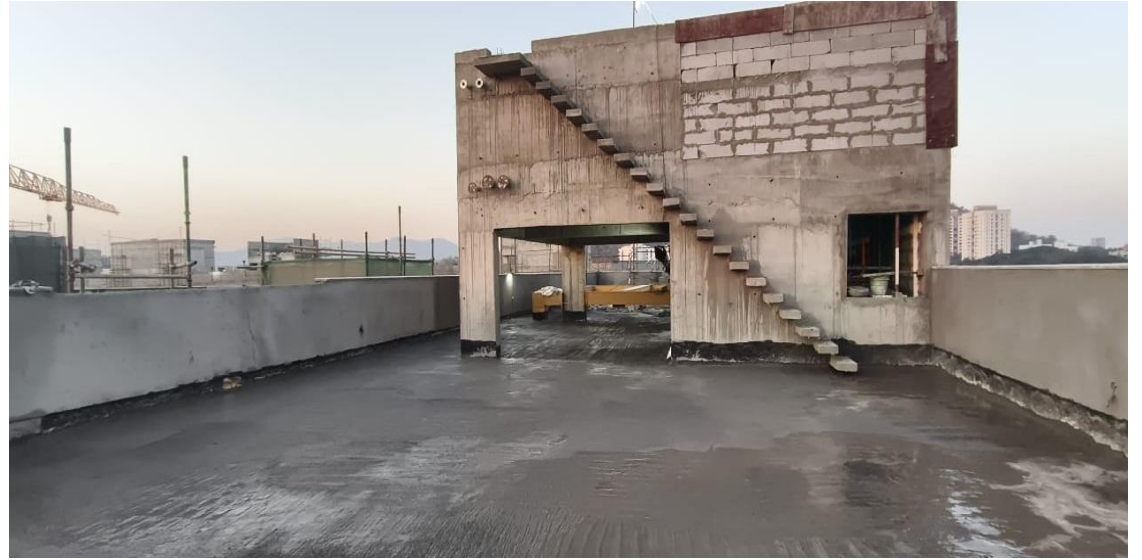
H-21-TERRACE WATER SCREEDING WIP