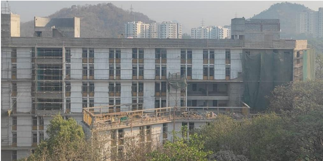
H-08 - EXTERNAL PRIMER WIP