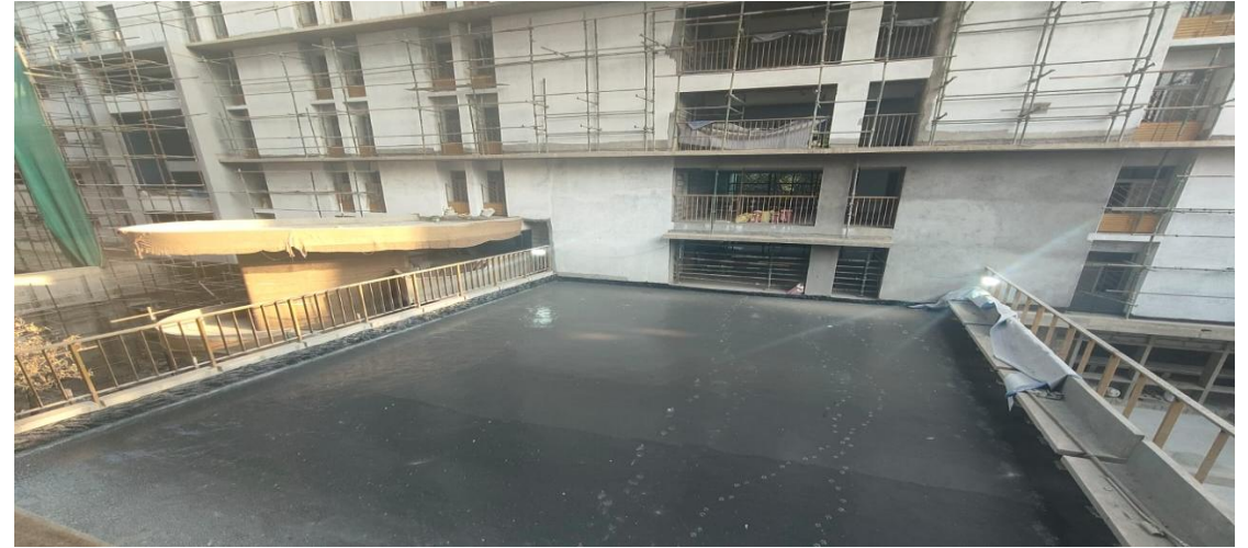
H-07 - CONNECTING SLAB WATERSCREDDING WIP